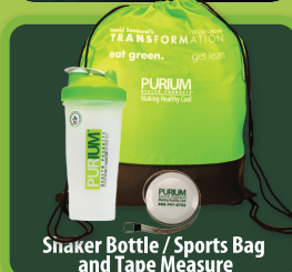
Snaker Bottle / Sports Bag and Tape Measure