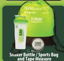
Shaker Bottle / Sports Bag and Tape Measure